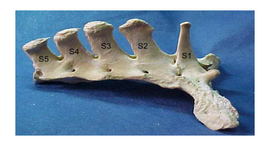
Fig. (2) :Photograph of a normal donkey sacrum with five fused vertebrae (Right view )