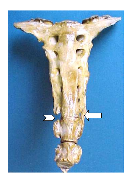
Fig.(4) Photograph of an asymmetrical sacrum of a donkey with 4½ sacral segments. Actually, there are 4 right sacral and 5 left sacral segments. The last segment is a sacrocaudal vertebra.

Notice : The lateral bony boundary of the last sacral foramen is present on the left side (arrow) and is missed on the right side (arrow head).