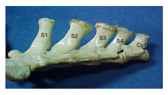
Fig. (1): Photograph of a normal donkey sacrum with 4 fused vertebrae and an attached caudal vertebrae( Left view )